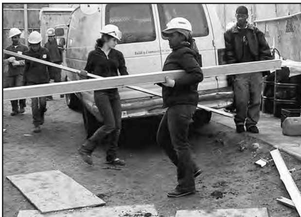
Students from Brearley and Browning upper schools add a new skill to their resume—building affordable homes. Read more on Page 2.