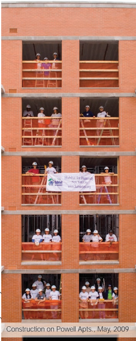
Construction on Powell Apts., May, 2009

“I have watched with pleasure and admiration as the neighborhood has seen a renaissance, and I hope future generations of youngsters will enjoy growing up here as much as I did.”