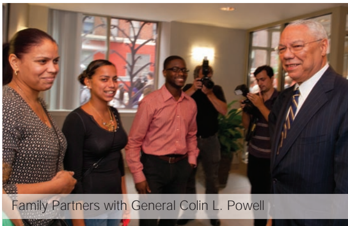
Family Partners with General Colin L. Powell

This building is a truly cooperative venture: Many of the government leaders who supported the project joined Powell at the ribbon-cutting. Among them were: