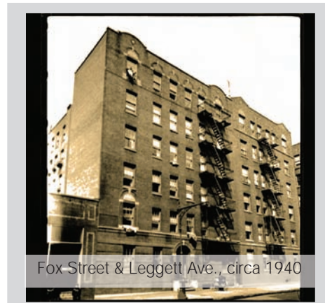
Fox Street & Leggett Ave., circa 1940