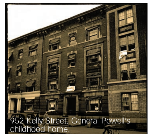
952 Kelly Street, General Powell's childhood home.