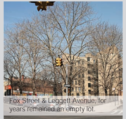
Fox Street & Leggett Avenue, for years remained an empty lot.