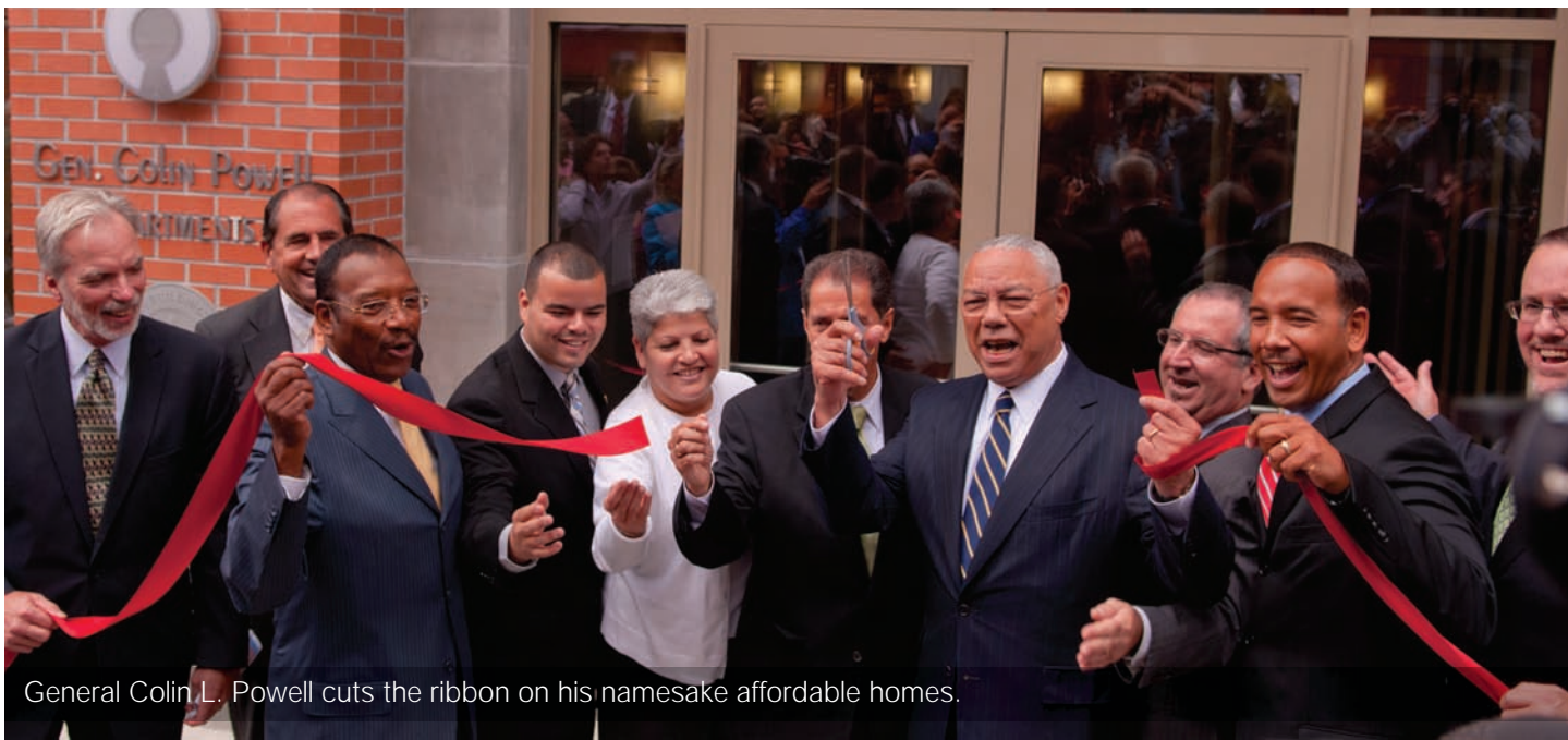
General Colin L. Powell cuts the ribbon on his namesake affordable homes.