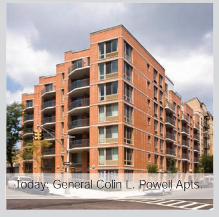
Today: General Colin L. Powell Apts.