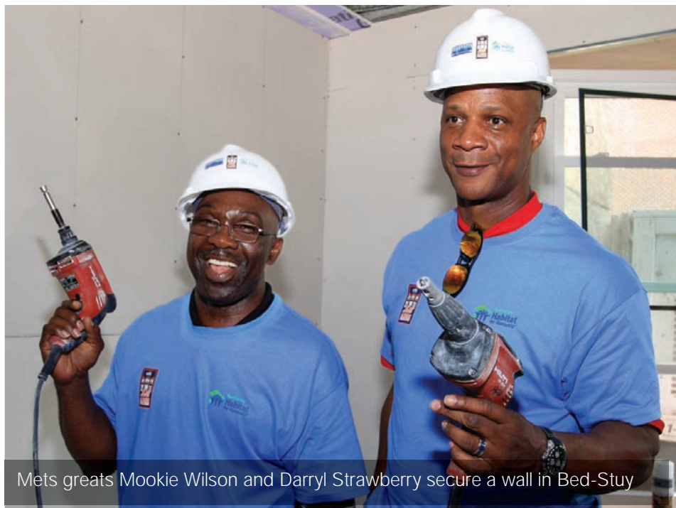
Mets greats Mookie Wilson and Darryl Strawberry secure a wall in Bed-Stuy